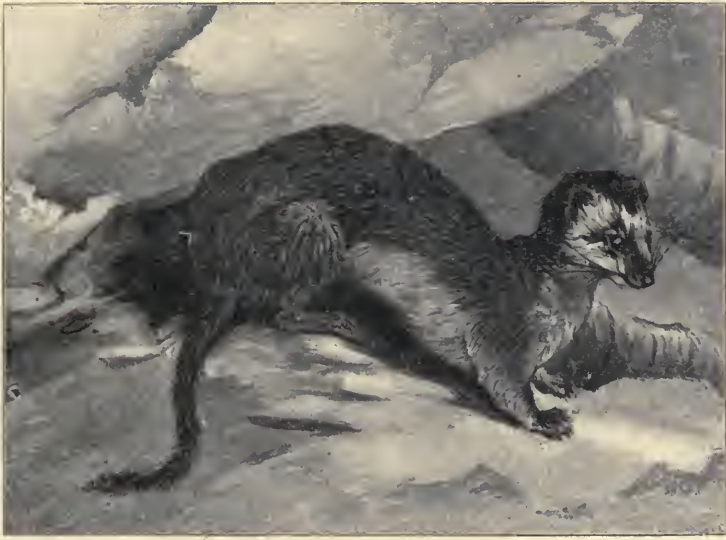
FIG. LVIII. PUTORIUS FRENATUS. BRIDLED WEASEL.